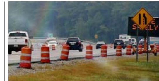
A familiar sight on central Arkansas roadways.