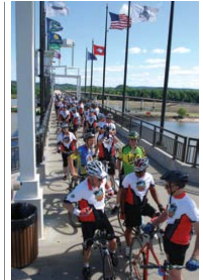
Riders lined up to cross the Big Dam Bridge to the MOU press conference.

2014: Livability Index was completed and designed as a Web site