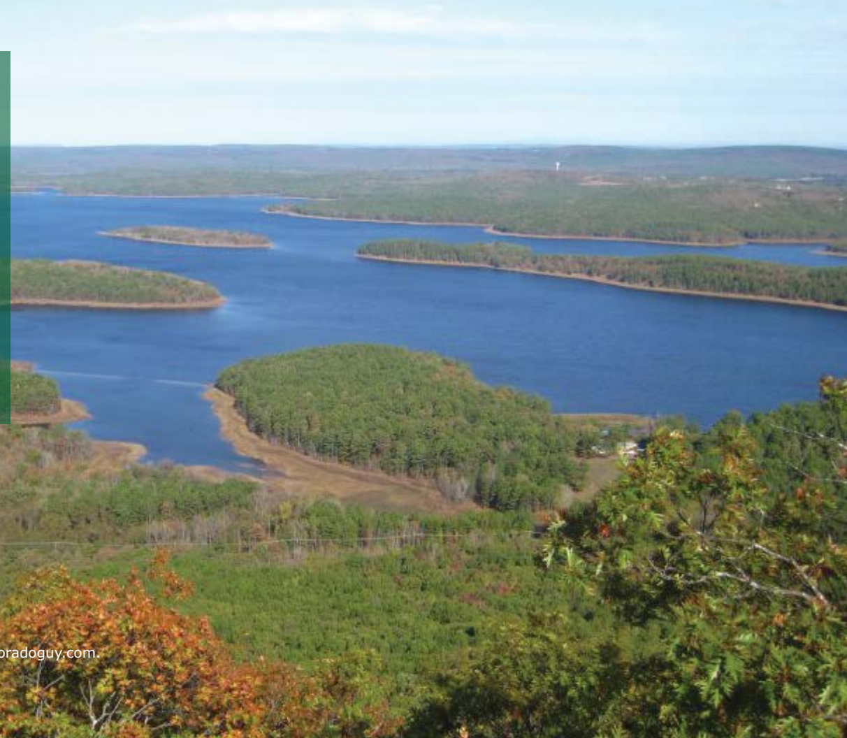
Photo: Lake Maumelle

The initial meeting of small and large water systems took place in 2001. A few years later the group Incorporated as the Mid-Arkansas Water Alliance, to “secure long-term sources of high-quality drinking water for its membership.”